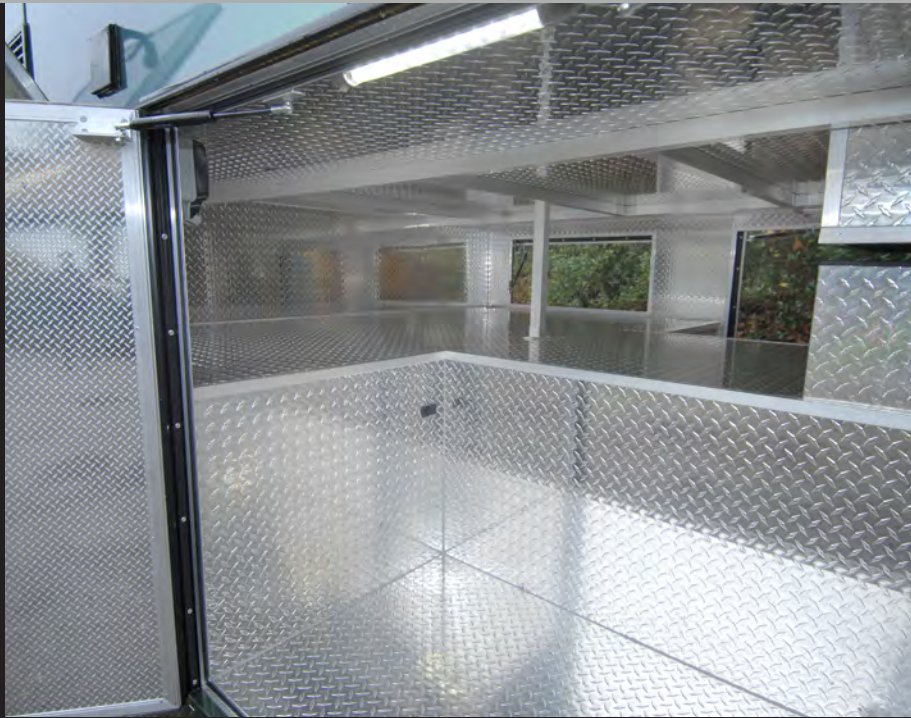
Spacious underfloor lockers cut back to maximise space. Access made easy from both sides with 4 large doors