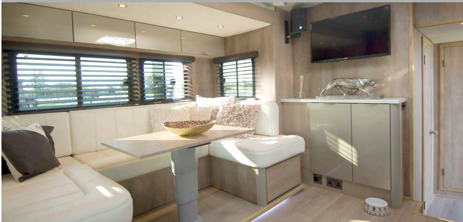
Beautiful living, bright, airy and spacious