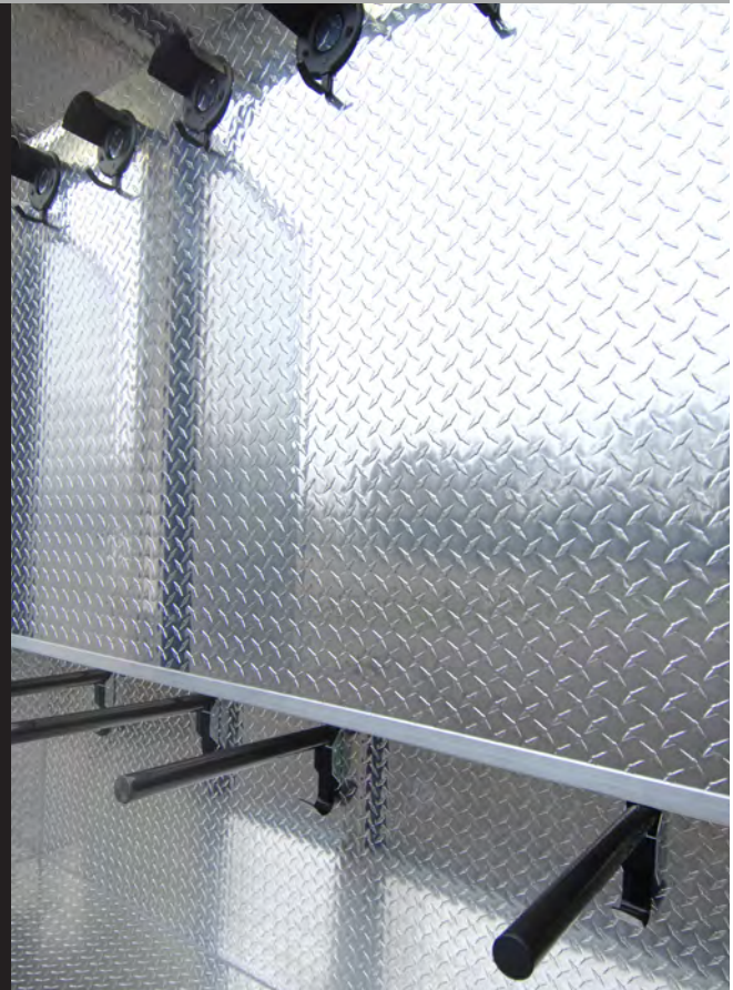
Slimline tack lockers to maximise space